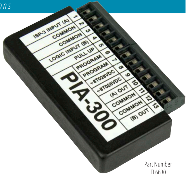
Part Number EL6630

The function of the PIA-300 is to protect and properly interface the flowmeter's reed switch or hall effect sensor to customer supplied electronics. (For example: counters, or programmable controllers.) The PIA-300 also amplifies the output signal from the flowmeter to be transmitted over a long distance (up to 2500' or 750m).