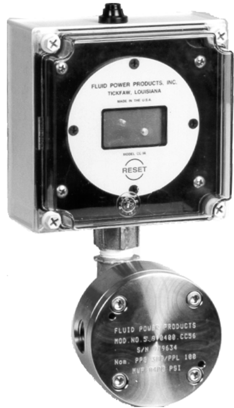
In NEMA 4X enclosure mounted on TM Series flow meter

Power Saver mode extends battery life by turning the LCD off if no pulse signal has been received for 60 seconds. It powers up automatically when pulse signals resume (or RESET button is pressed).