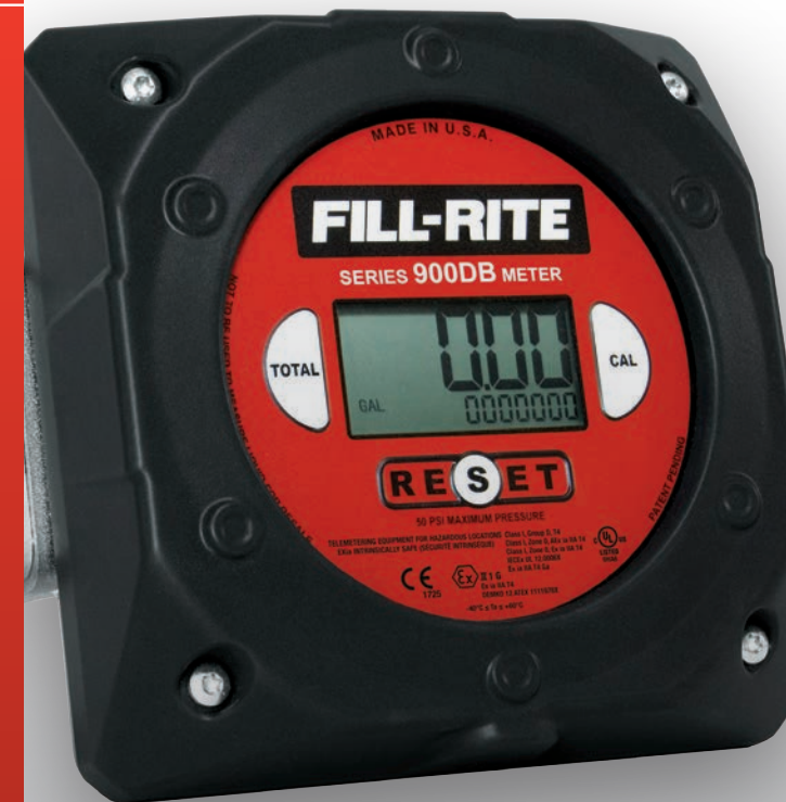
Model 900CD Shown

PIONEERING THE FUTURE. SERIES 900CD DIGITAL METER